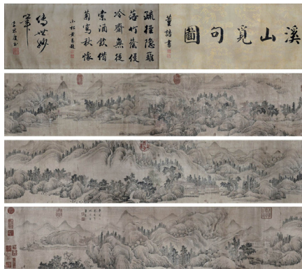
Ming Dynasty painter Dong Qichang created 'Poetic Landscape,' ink and color on paper, in 1621. It has nine emperors' seals, 10 collectors' seals, a frontispiece by Dong Gao, and colophons by Huang Li and Li Enqing. Estimate: $150,000-$200,000.

Completing the collection of devotional items is an unusual aloeswood sculpture of the Liuhai parade of toad bringing forth coin. Pungent and treasured, aloeswood is rarely found in pieces large enough to carve. Lot 160, 2 1/2 inches tall, is valued at $3,000 - $4,000.