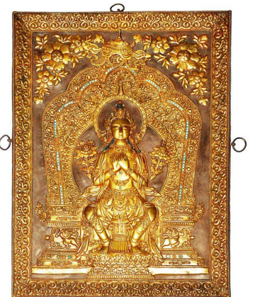
This Tibetan gilt bronze with Avalokiteshvara in Dharmachakra Mudra is a 13th/14th century icon that has survived tumultuous times, 23 in. x 17½ in. Estimate: $30,000 - $50,000.