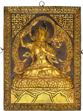
Designed in the 13th/14th century as a decoration for a large stupa, this Tibetan frieze of Avalokiteshvara in Dhyanasana is backed by a manorial and flanked by symbolic foliage, 22½ in. x 17 in. Estimate: $30,000 - $50,000. Gianguan Auctions Image