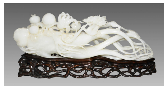
A Hetian jade carving of lingzhi with Dragon and Peach is composed of symbols of longevity. The translucent stone is of an even white tone, 15½ inches long. Estimate: $40,000 - $50,000.