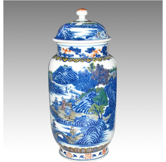
A Doucai lantern vase features a landscape populated by foreigners bringing offerings by boat, on horseback and on foot, 12 1/4 inches tall. Estimate: $25,000 - $40,000