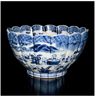
Blue and White Sixteen-Lobed Large Bowl. Ming. Shi Yang Tang Collections, New York. $400,000 - $600,000