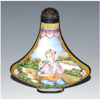
A Pouch-Shaped Snuff Bottle with Enameled Cartouches Depicting Western Figures of Mother and Child $2,000 - $3,000