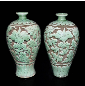
A Pair of Cizhou Carved Green-Glazed Meipings $15,000 - $20,000