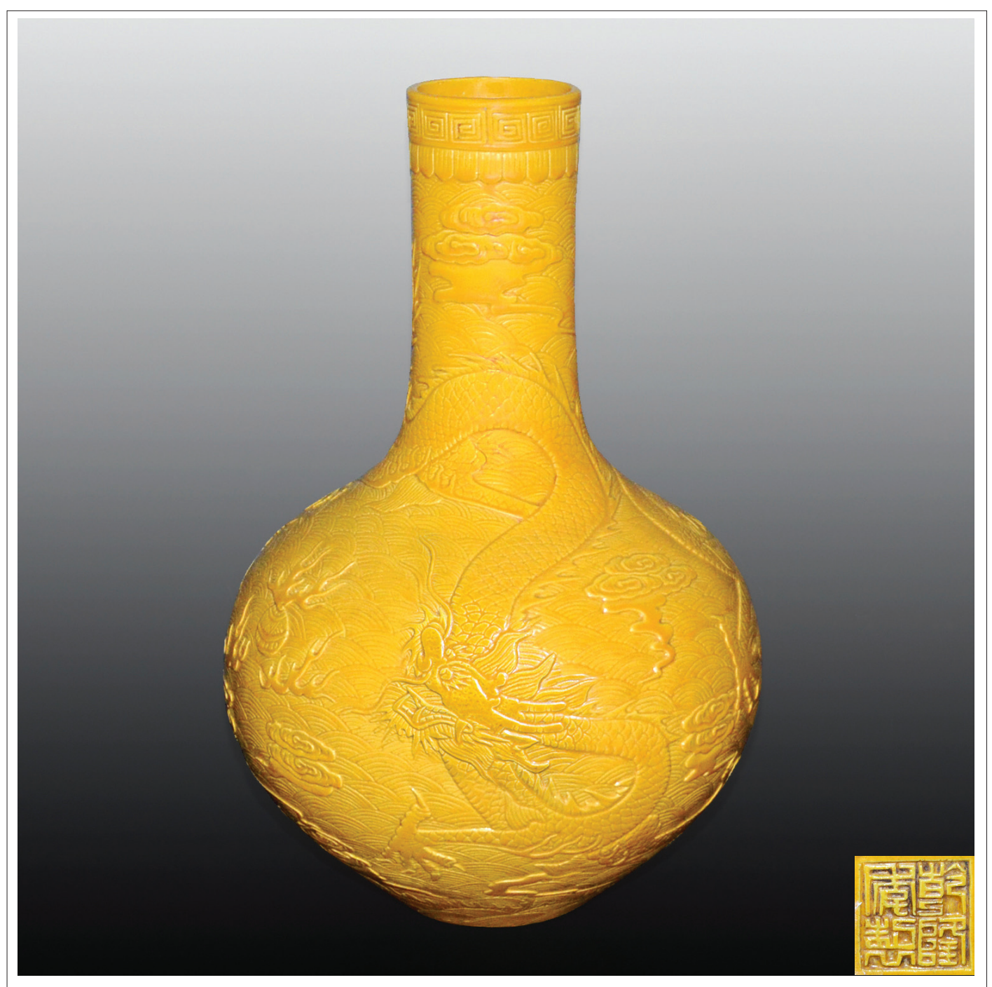
Qing yellow-glazed globular vase carved with confronting dragons.

Porcelains come to the podium in many forms and glazes, many of them rare and important. The catalog cover, for instance, features an 18th century Qing masterwork of form and color unlike any that has come to the podium in recent times. Experts at China Institute in New York have stated that porcelains of the period are notable for the perfection of their bodies and the opaque overglaze enamels that embellished them. Lot 190 is a prime example. The graceful globular form with slender neck is glaczd in a vibrant yellow that is consistent and even overall. Were that not sufficient, It is further decorated with carvings of two dragons contesting a pearl among ruyi clouds and flames. A key fret band encircles the mouth and a turbulent wave encircles the foot. Of the Imperial kiln, it is of period and bears the Qianlong four character relief mark. Standing 13-inch tall, the vase is conservatively valued at $300,000-$500,000.