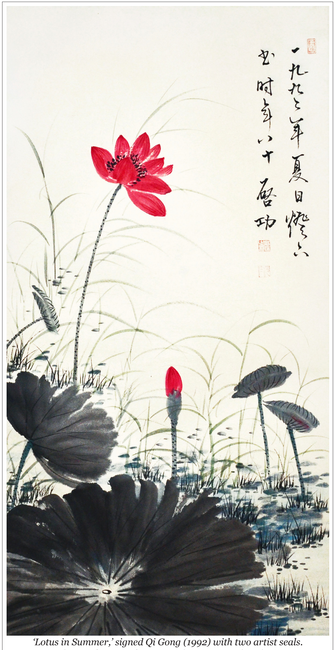
Estimate: $10,000-$20,000.

The auction on Saturday, June 25, begins at 10 a.m. Eastern. It will be conducted live at Gianguan Auctions, 39 W. 56th Street in New York City. For condition reports, contact the gallery director at 212-867-7288 or email info@gianguanauctions.com.