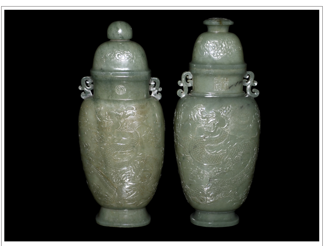
Celedon green jade Mughal style vases with covers. The tall baluster form vessels with ruyi handles are carved in low relief with dragon and phoenix amid scroll sprays. Estimate: $6,000-$8,000.

Also Qing is a rare pair of celadon green jade Mughal style vases with covers (below). The tall baluster form vessels with ruyi handles are carved in low relief with dragon and phoenix amid scroll sprays. The pair is Lot 109 and will command as much as $30,000. Meanwhile, Lot 90, a greenish-white jade vase with cover, also Mughal style, and hexagonal in form and featuring scrolling handles, takes the podium at Lot 90. They are valued at $6,000-$8,000.