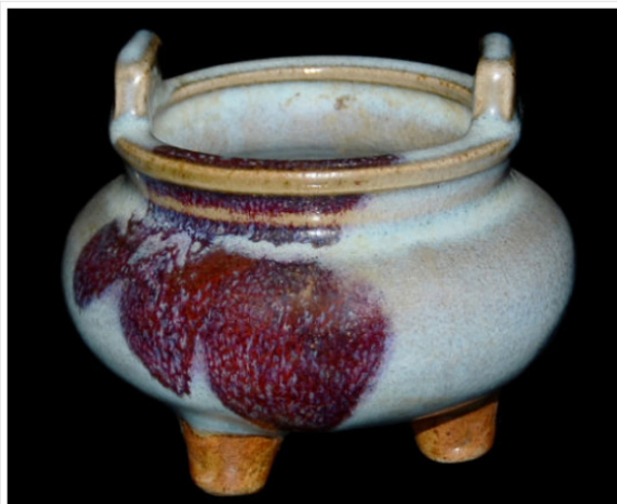
Song Dynasty, purple splashed Junyao tripod censer with upright handles. 3 3/4 inches high.

Song ceramics, timeless with subtle silhouettes and refined forms with sophisticated designs are well represented here with Lot 57, a rare green-glazed marbled pottery lamp with handle; Lot 102, a Yaozhouyao celadon glazed reverse flow flask ewer, a small hole on the underside through which water is filled. Another good example of Song ceramic is Lot 53, a purple splashed Junyao tripod censer.