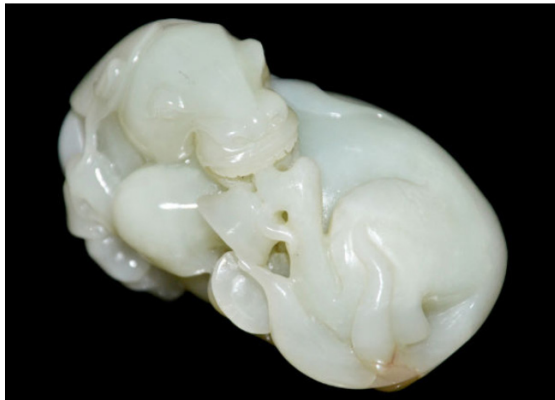
Hetian white jade horse, 3.6 inches long.

Notable among the Yixing Zisha teapots are Lot 153, Gu Jingzhou's teal-blue teapot molded with bamboo section and poem inscription, and Lot 151, hexagonal teapot in sections with a well-fitted lid separating a curved handle and spout.