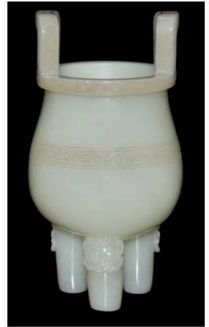
Qing white jade tripod Ding censer, 5 3/4 inches high. Gianguan Auctions

Scholars' items feature a rare Duan inkstone, Lot 113, with 13 "eyes," utilizing the natural texture of the stone to sketch a thunderous scene of wispy cloud. Lot 118, a cylindrical brush pot of carved Huanghuali is decorated with pine and crane as longevity symbols.